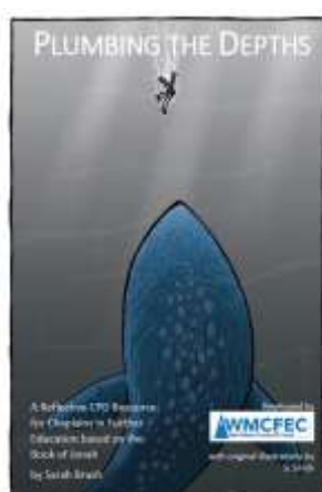
Plumbing the Depths

SMSC Development Resource for 16-19s in College (2021)