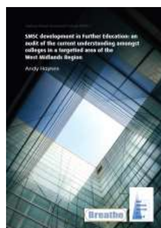
SMSC Development in FE

Reflective CPD resource for FE chaplains based on the Book of Jonah (2016)