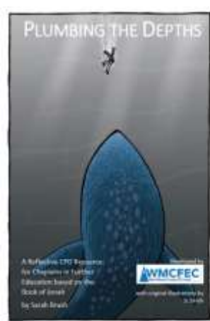
Plumbing the Depths

SMSC Development Resource for 16-19s in College (2021)