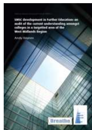
SMSC Development in FE

Reflective CPD resource for FE chaplains based on Jonah (2016)